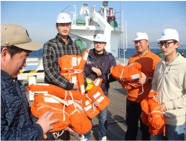
How to put on life-jackets