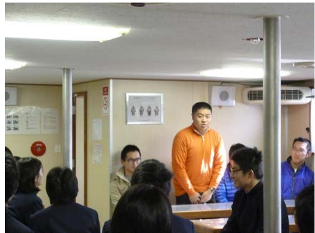
Students introduce themselves

Many kinds of training concerning the ocean and the vessel were conducted on board. The students gained valuable experience such as how to put on life-jackets, cleaning, a vessel inspection tour, oceanographic observation with CTD (Conductivity Temperature Depth profiler), sailor discipline, a lecture from Professor Watanabe on naval architecture and rope work training on the deck that will also be of use in everyday life.