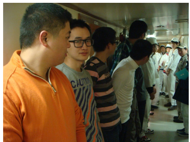
First officer's night inspection tour