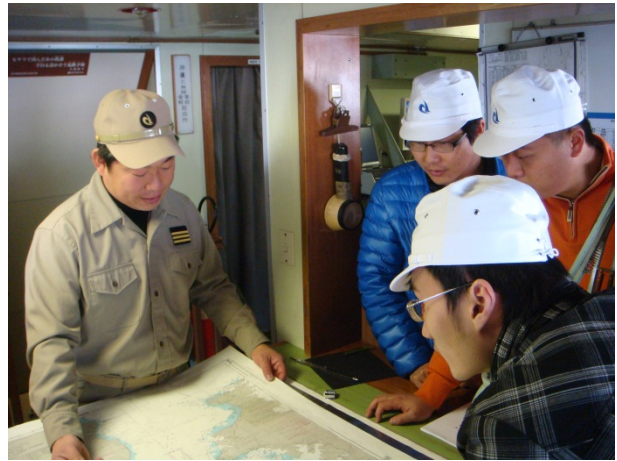
Explanation of sea charts on the bridge