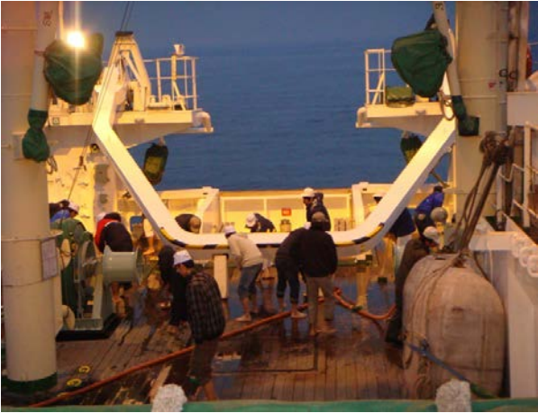
Washing the deck on the morning of the 22 nd