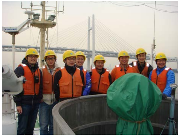
Compass deck stationing on arrival at Yokohama Port