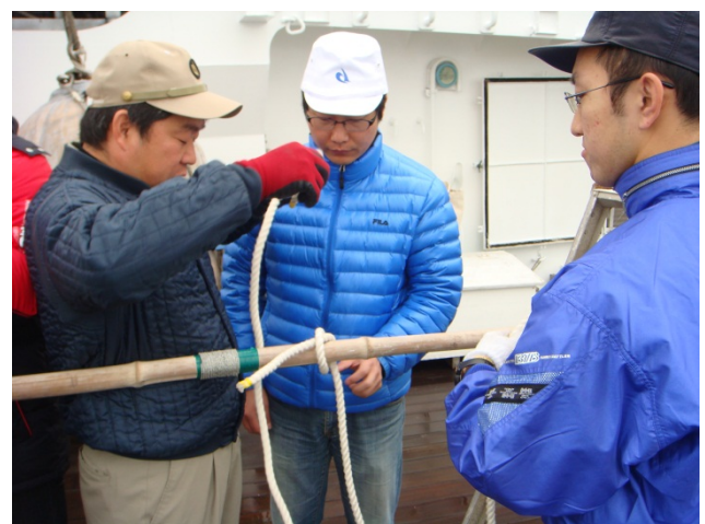
Rope work training