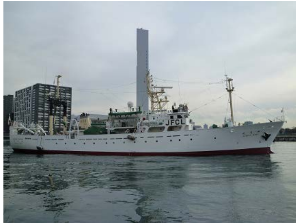
Tokyo University of Marine Science and Technology training vessel, Shinyo-Maru

An embarkation ceremony was held before departure and after the crew was introduced and pointers about life on-board were explained, all participants introduced themselves. This cruising training was held in conjunction with the 4 th year undergraduate Training on Board IV course.